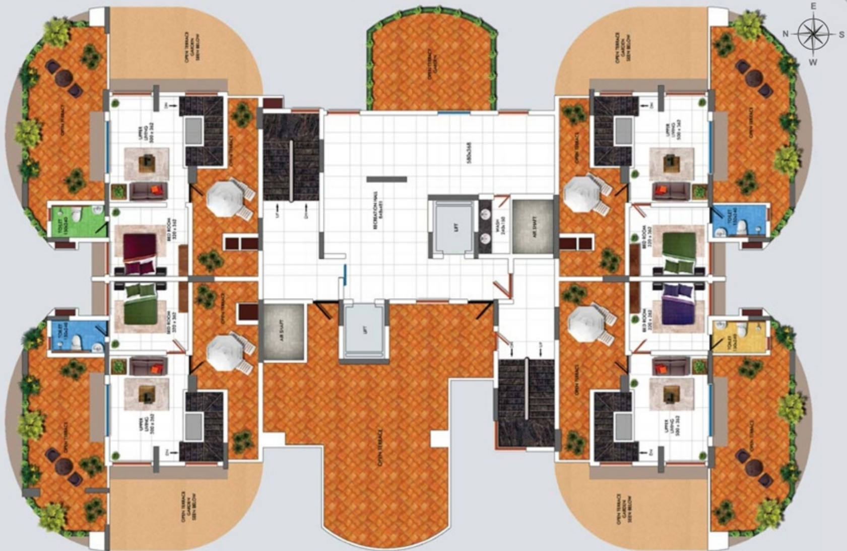
TERRACE FLOOR PLAN - 15 th Floor