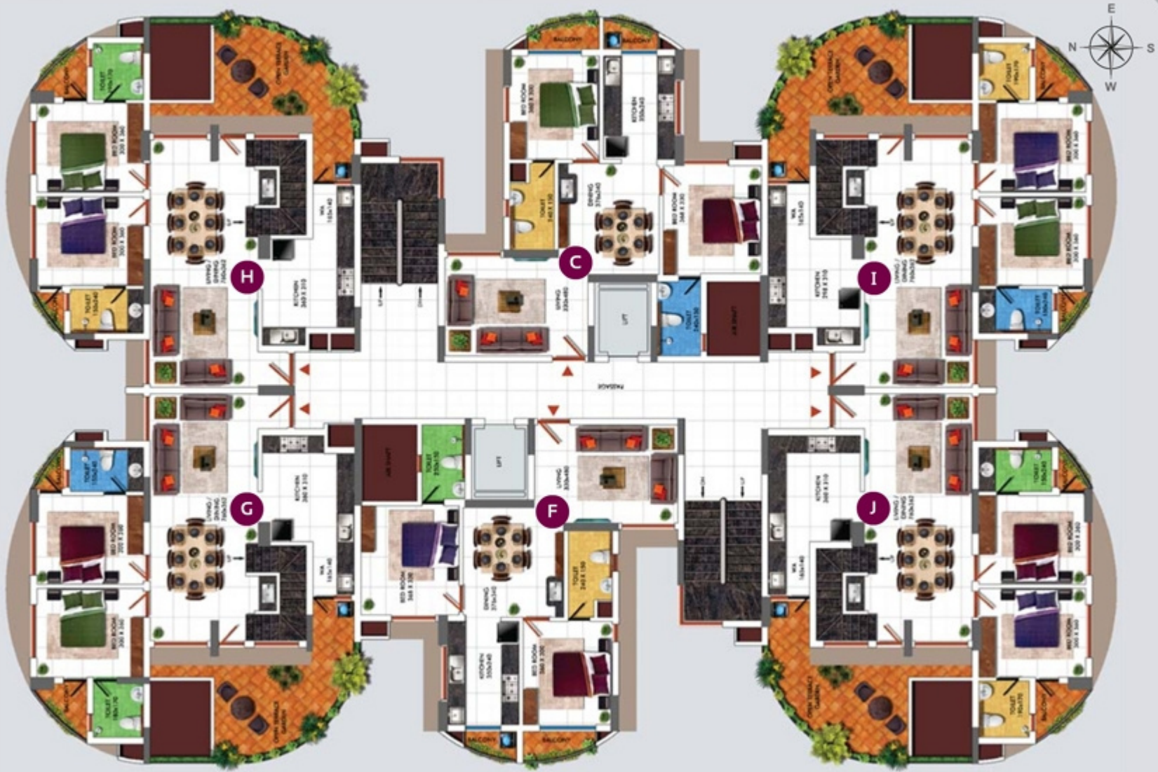
TYPICAL FLOOR PLAN - 14 th Floor