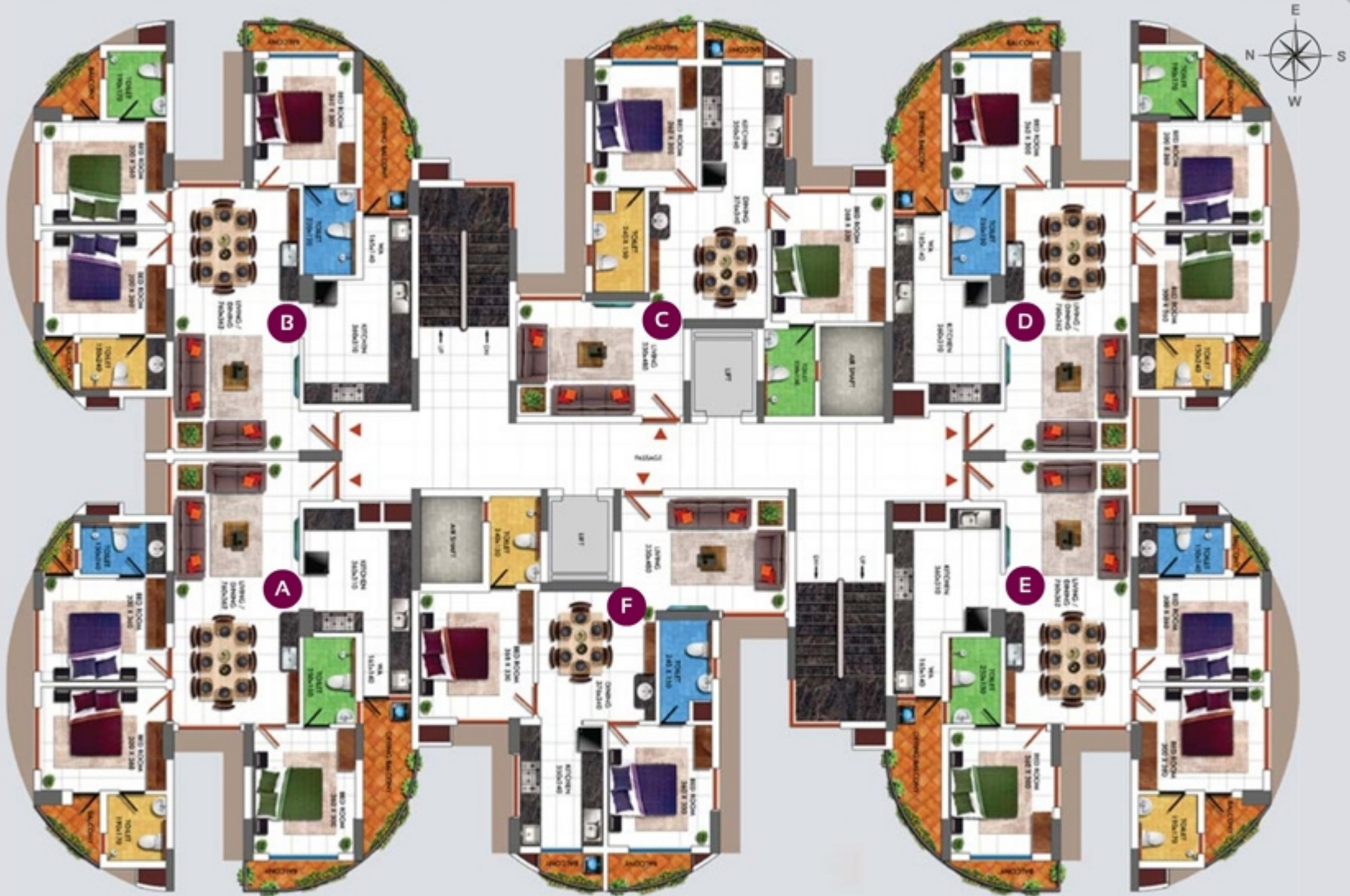
TYPICAL FLOOR PLAN - 1 st to 13 th Floor