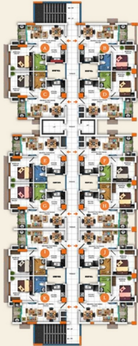
TYPICAL KEY FLOOR PLAN | 1 st to 12 th Floor